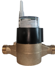
Meter Transceiver Register (MTR) - AMR/AMI