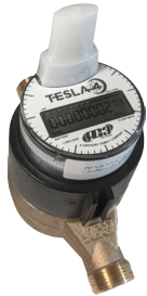
Meter Transceiver Register (MTR) - AMR/AMI