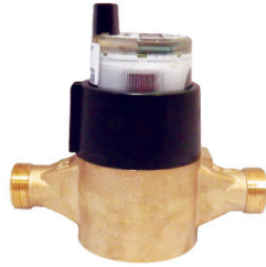
Meter Transceiver Register (MTR) - AMR/AMI