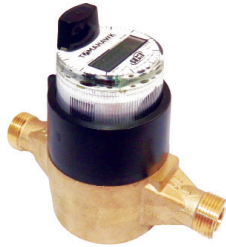
Meter Transceiver Register (MTR) - AMR/AMI