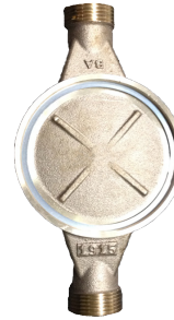
Perpetual® PD - Bottom